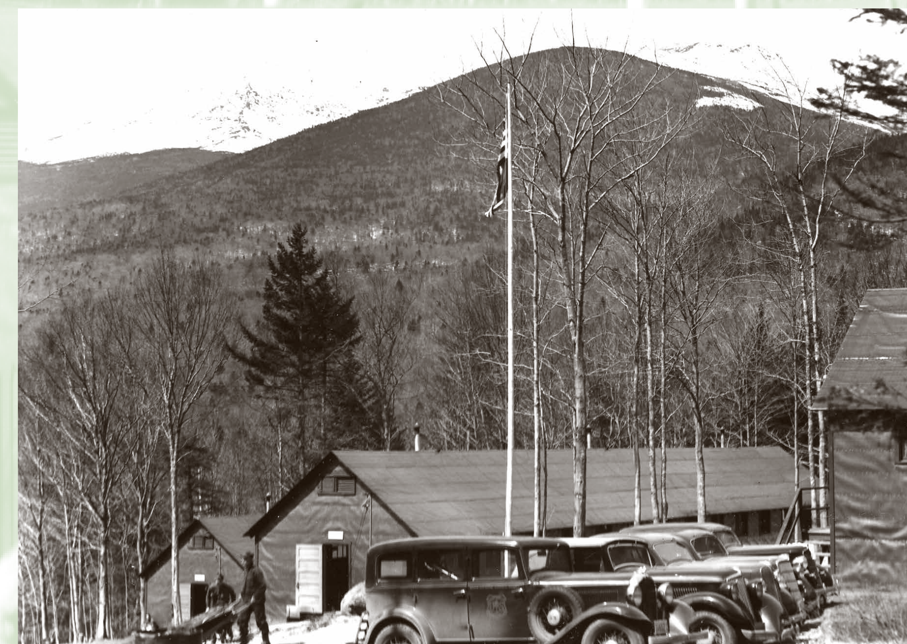
FOREST HISTORY SOCIETY, DURHAM, NC